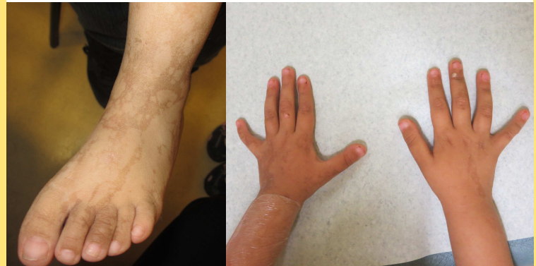
Fig. 2: Linear hyperpigmentation on the hands and legs