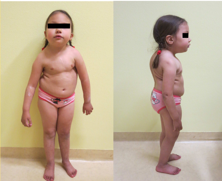
Fig. 1: The patient's appearance on frontal and lateral views